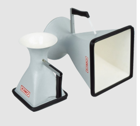
MT 51 : ABS transport